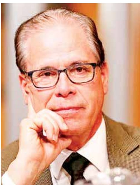
U.S. SENATOR MIKE BRAUN

U.S. Senator Mike Braun (R-IN) and U.S. Senator John Kennedy (R-LA) introduced legislation that will prohibit individuals delinquent on their taxes from using the Export-Import Bank. “The Export-Import Bank should not serve as an ATM for tax delinquents and this legislation will address this loophole, while also rooting out potential fraud from dozens of companies,” said U.S. Senator Mike Braun. “American taxpayers shouldn’t be forced to subsidize businesses that haven’t even paid their own taxes, and I’m proud to work with Sen. Braun to bring accountability to the Export-Import Bank,” said U.S. Senator John Kennedy. BACKGROUND: The Export-Import Bank of the United States (EXIM) requires companies applying for certain financing to self-certify