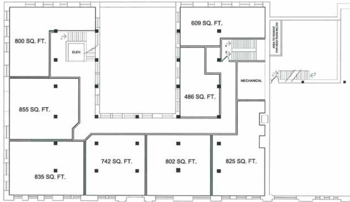
1 LEVEL 3 FLOOR PLAN SCALE: 1/16"=1'-0"