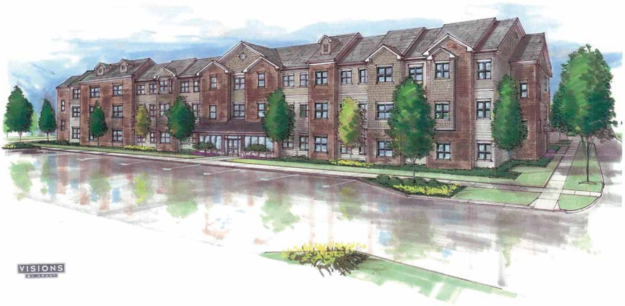
PROPOSED SENIOR HOUSING LOFT APARTMENTS BY MVG & EHA AT SE10TH STREET & LINCOLN AVENUE AREA IN EVANSVILLE, IN