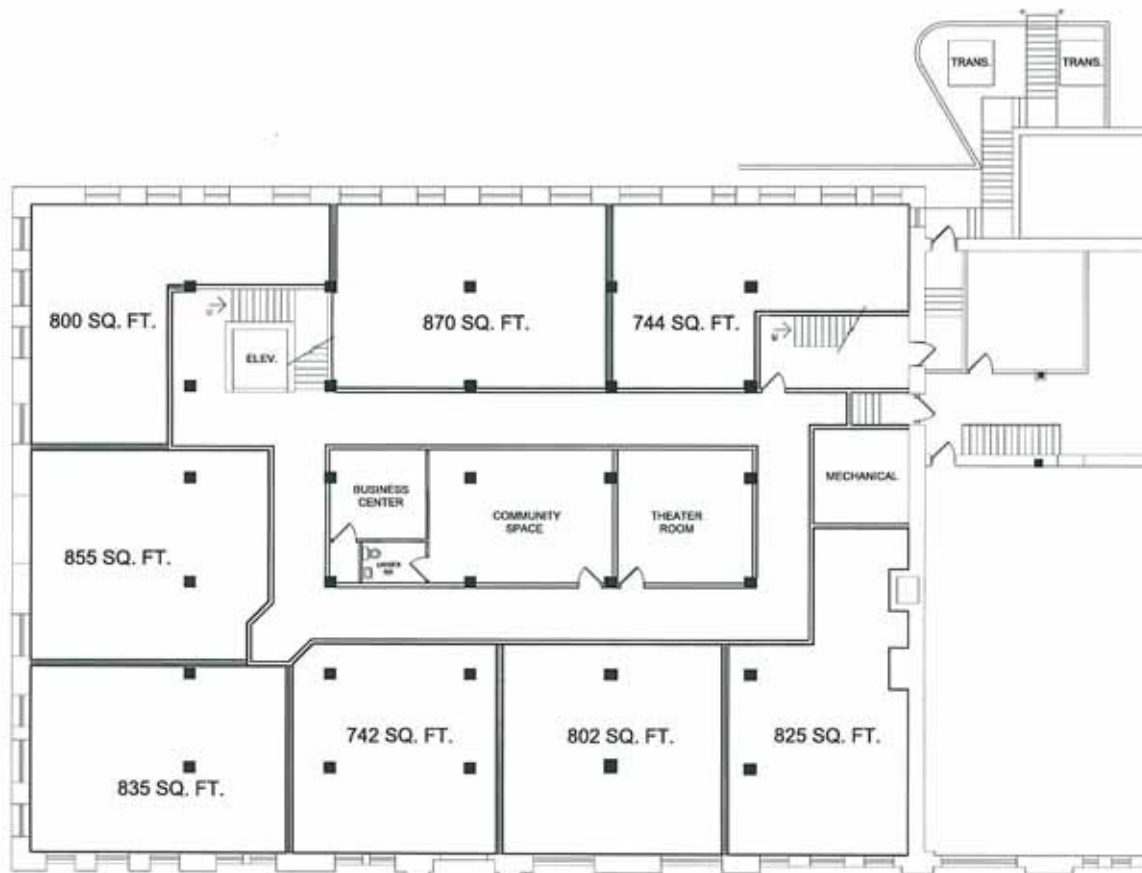
1 LEVEL 2 FLOOR PLAN SCALE: 1/16"=1'-0"