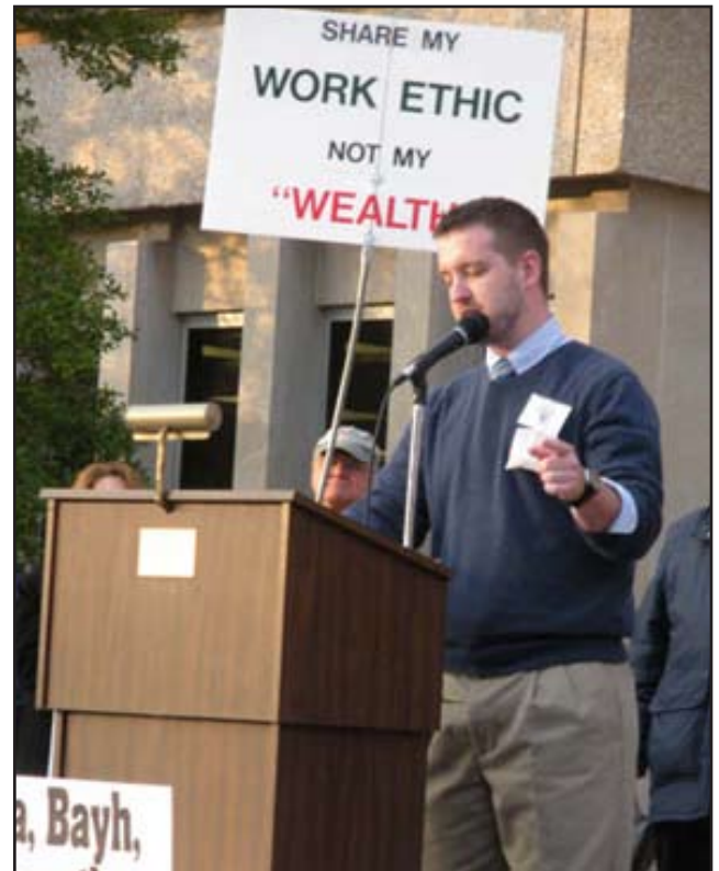
Story by Hobart Scales Independent Political & Public Policy Consultant

A downtown stadium, a good idea. But the city hasn't fixed a screwy road system downtown in which one